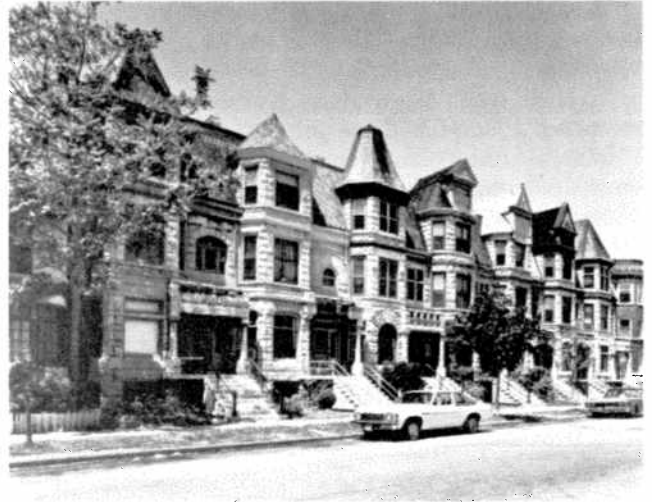
These row houses on Blackstone Avenue were built in 1891. Although row houses and apartment buildings have been built in the community, Kenwood remains suburban in character.